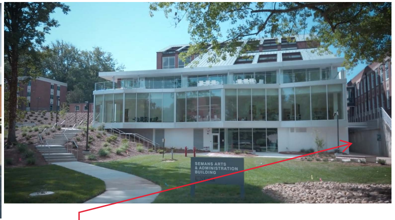
The Semans Arts and Administration Building (SAAB) is # 28 on the map above. Enter at the lower left as indicated by the arrow in this photo.