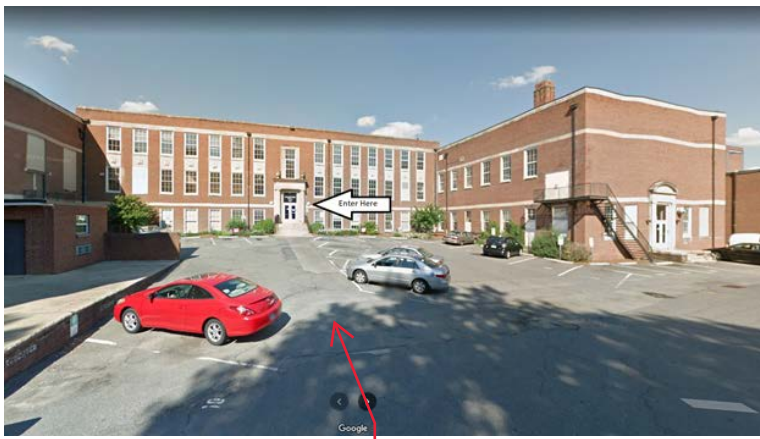
Parking lot at 1931 Kenan Drive and entrance to Gray Building indicated with an arrow on this photo. Gray Building is # 31 on the map above.