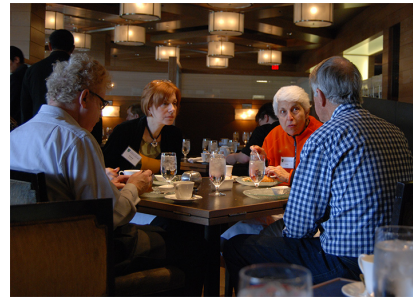
Board members connect in D.C.