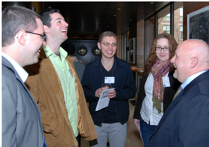
Alumni at the awards ceremony