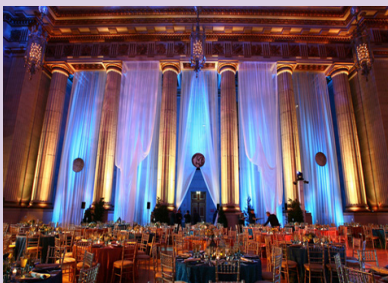
Washington National Opera