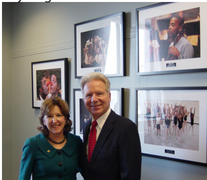
John Mauceri and Senator Hagan with photographs from UNCSA.