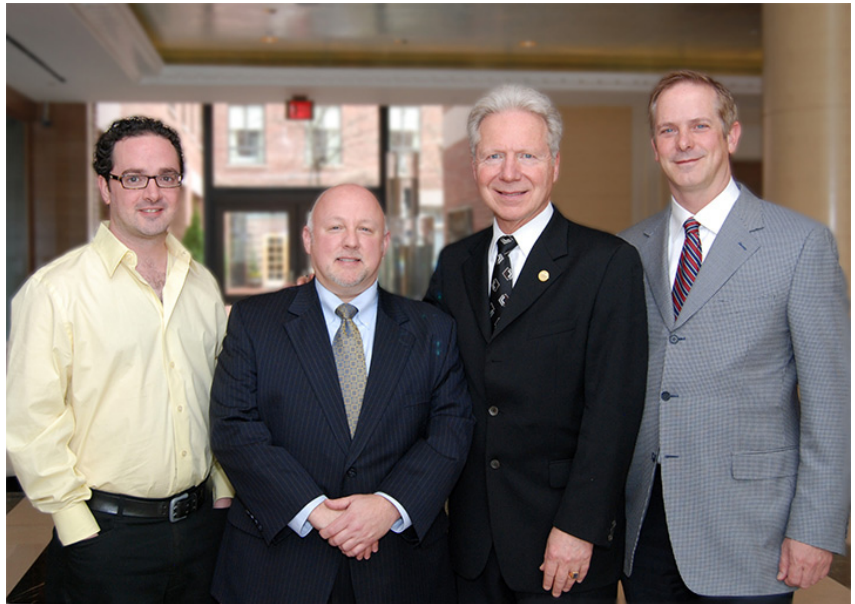
Recipients of UNCSA Alumni Achievement Awards in Washington , D.C.