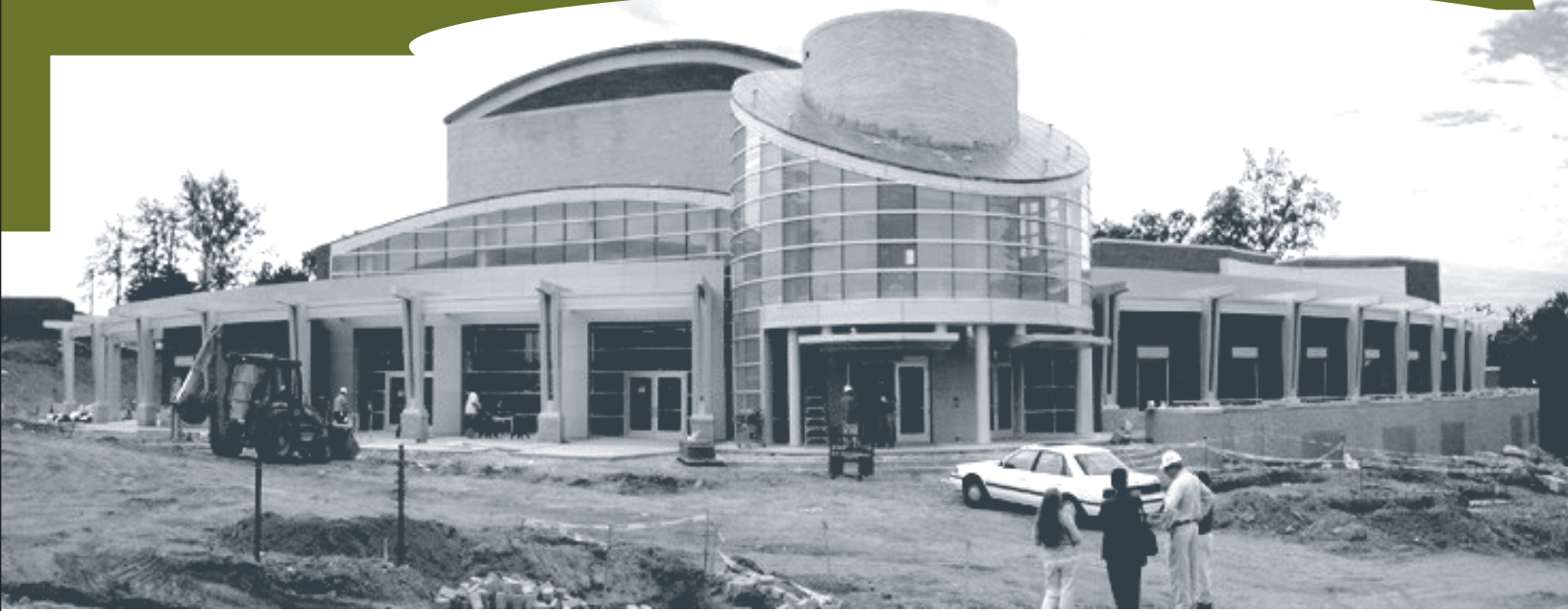
The new School of Music Complex.