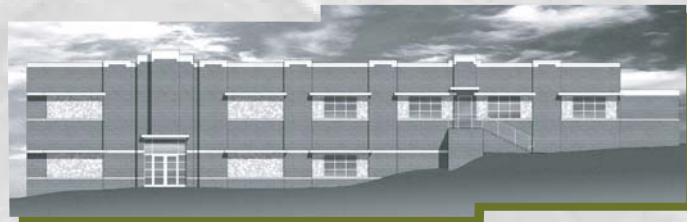
Architect's rendering of the School of Filmmaking Archives storage facility.

By the end of 2003, we should have a completed Film Archives storage facility, so that we can finally get all 25,000 of our film prints under one temperature and humidity-controlled