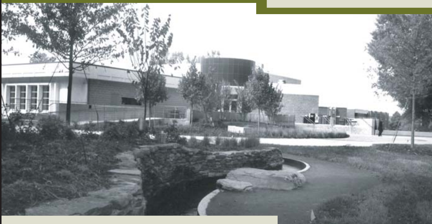
The Charlotte & Phillip Hanes Student Commons and Daniels Plaza, East view.