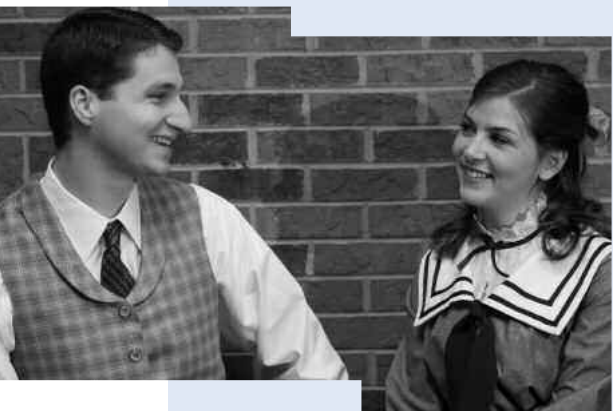
The Fletcher Opera Institute presented the new American opera "Our Town" in both Winston-Salem and Raleigh, NC. The opera made its Southeastern premiere at NCSA.