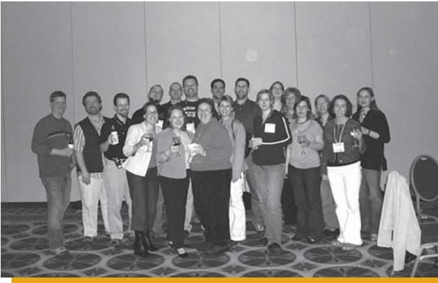
Students, faculty and alumni gathered at the NCSA reception held during USITT's National Conference in Louisville, Ky.