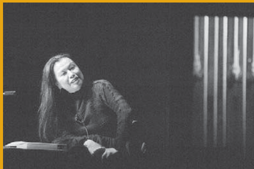
Eiko Ishioka, designer and avant-garde artist, presented a multi-media retrospective of her work.

I F YOU WOULD LIKE TO MAKE A GIFT to NCSA, you may do so through the Alumni Fund. Your gift, combined with those of other alumni, strengthens the annual operations of the School and helps provide scholarships, support for guest artists, touring and outreach.