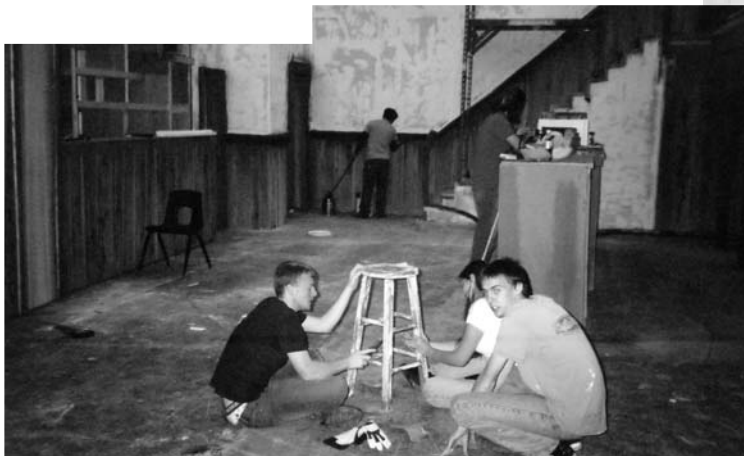
Film students in the Film Production Design program work on the set for DRIFTWOOD, a fourth-year film being shot on Stage Six in the School of Filmmaking.