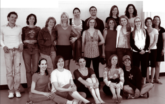
"Babies from the 80's" Reunion