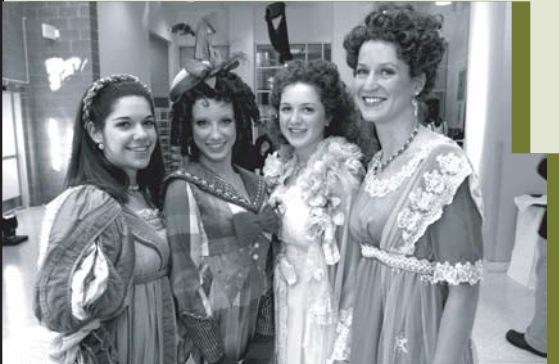
"A Stitch in Time."