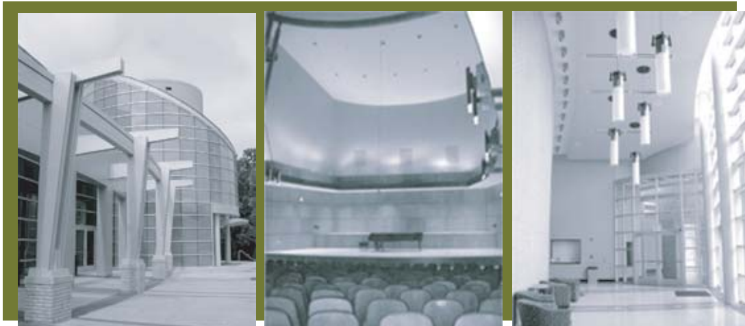
The new School of Music Complex.