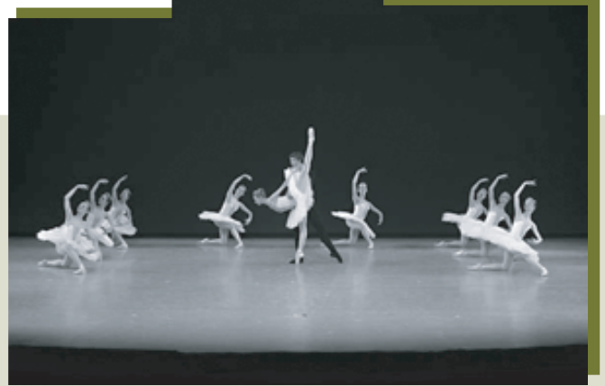
Balanchine's "Symphony in C" from Winter Dance Concert 2004.