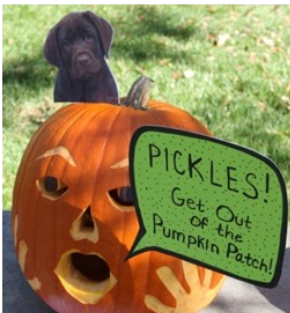
2 ND PLACE WINNER