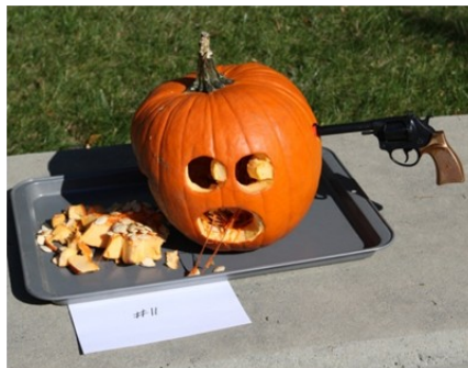
District 8: Film Village