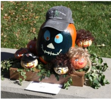
District 11: HS Academic Prgm & Drama