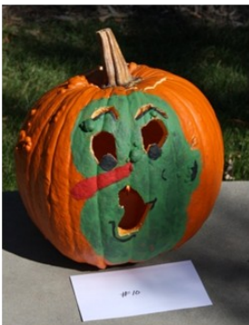
District 14: Music