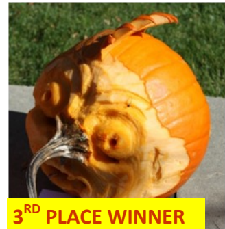
3 RD PLACE WINNER