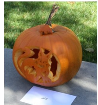
District 16: Semans Library