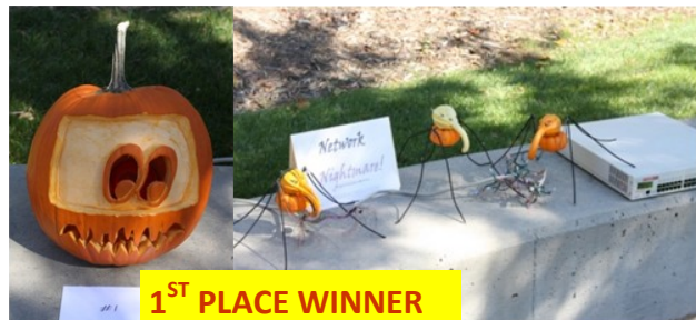
1 ST PLACE WINNER