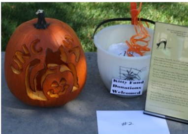
District 2: Admin Bldg, 2nd Fl