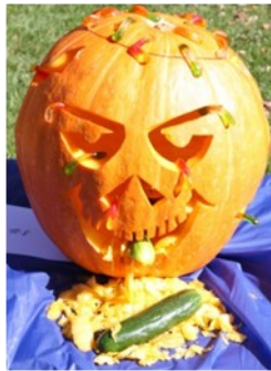
District 13: Welcome Ctr