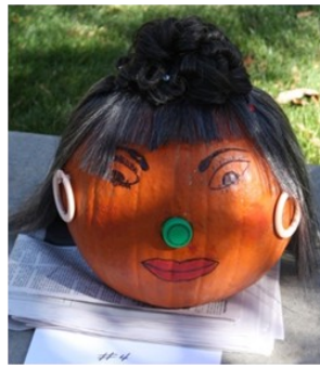
District 7: Housekeeping