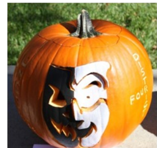
1 ST PLACE WINNER